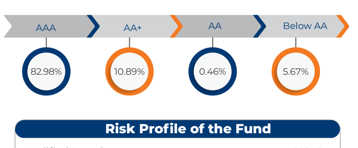
Debt Rating Profile